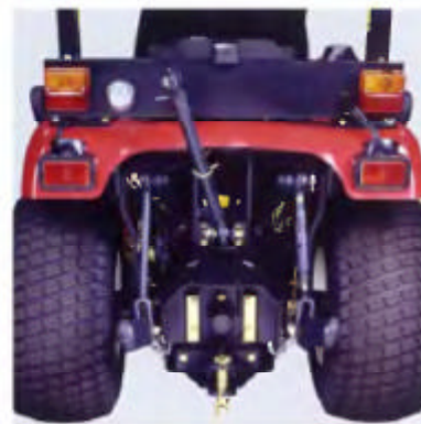
Category I Three Point Hitch & Fixed Drawbar