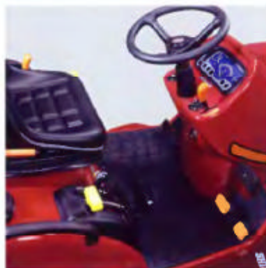
Operator-Friendly Instrument Panel, Levers, and Pedals